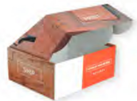
FRONT ROLL TUCK